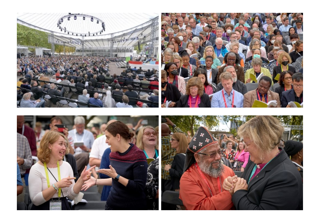
The next WCC Assembly will take place in 2030.

To find more information via the WCC website, please follow this link.